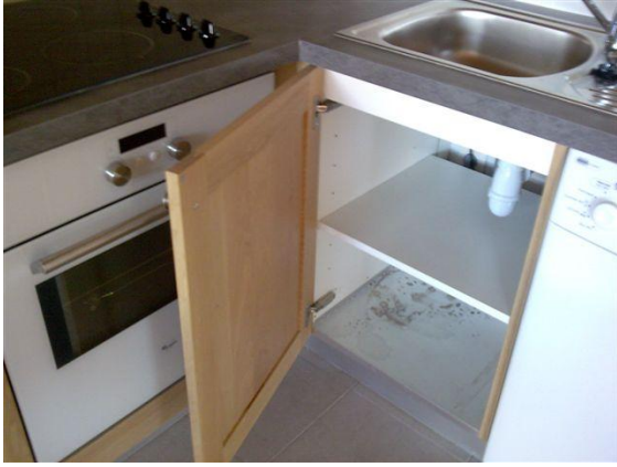
The sink is leaking

Write the problems underneath each picture